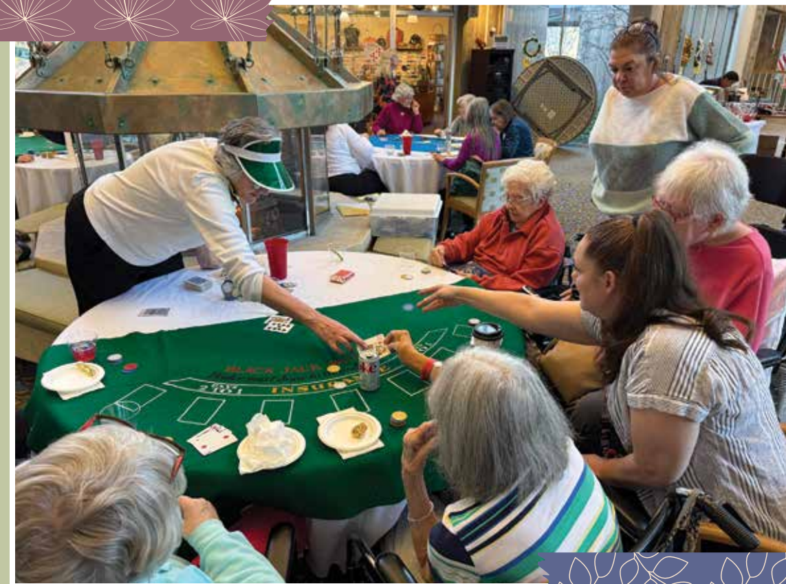
Auxiliary members host Casino Afternoon for residents.