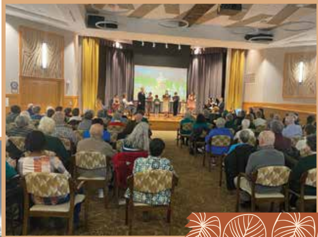
Community members enjoy a performance.

The Forest Ranger program is a paid professional training internship designed for college undergraduates to develop conservation and land management skills while working for a summer at the McLean Game Refuge. This program is a wonderful success that has supported the Game Refuge tremendously through the hard work, bright ideas, and enthusiasm of college students. It has increased the capacity of the Game Refuge to engage in habitat management, trail maintenance, and connection with the community. Forest Ranger alumni have taken their skills acquired at the Game Refuge to dozens of organizations locally, regionally, and nationally.