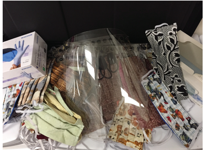
Donated PPE from McLean friends

Donations from the community continued throughout 2020. We would like to acknowledge the following donors who supported the COVID-19 appeal: