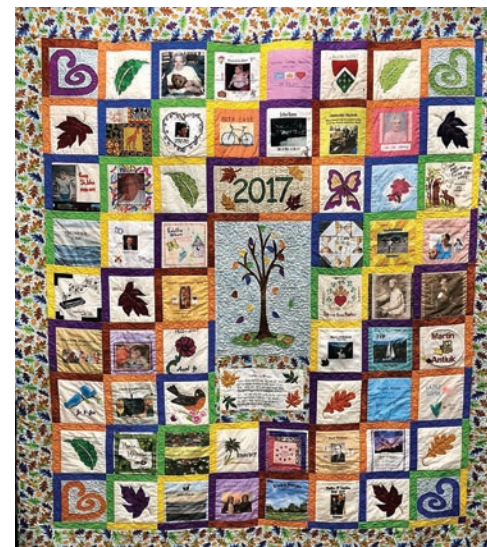
The McLean Hospice Memorial Quilt