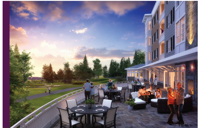
Rendering of Expansion

In accordance with the mission of McLean, there are a variety of health care and supportive programs that serve the local community. More than seven monthly support groups are held in the local communities, educational seminars are held more than 24 times each year, and students are mentored and trained by McLean staff.